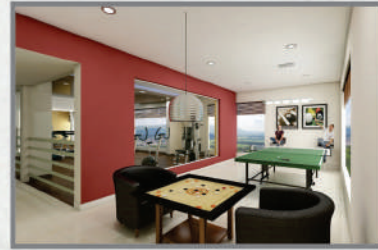
Gymnasium & Indoor Games