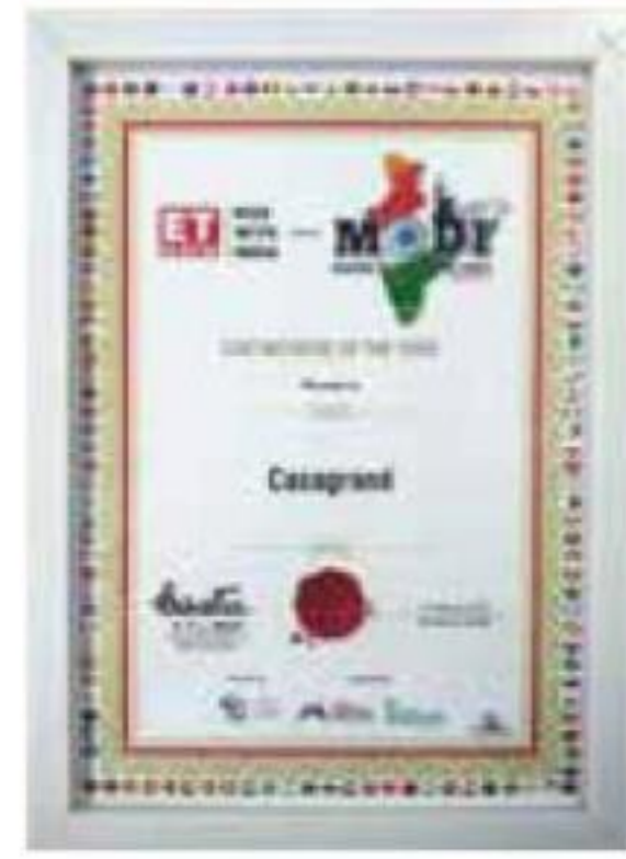
CSR Initiative of the Year - 2018 ET Now