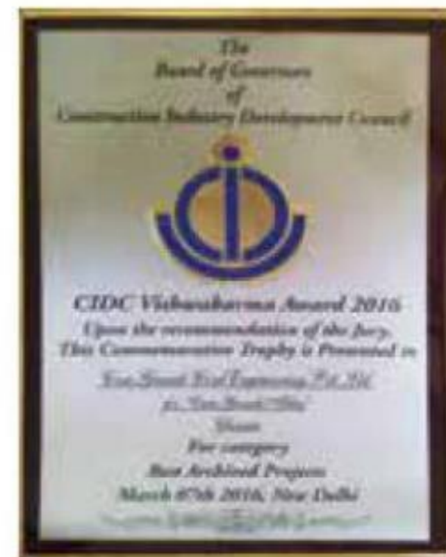
Best Archived Project Casagrand Aldea CIDC Vishwakarma Award 2016