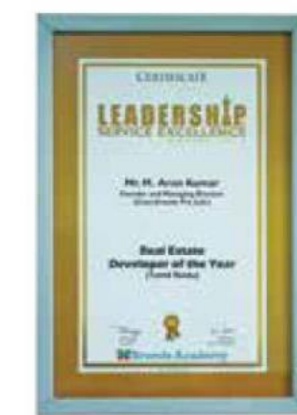
Real Estate Developer of the Year - 2013 Brands Academy