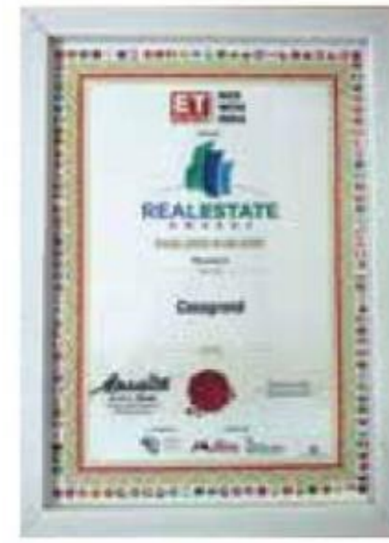
Excellence in Delivery - 2018 ET Now