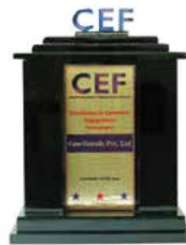
Excellence in Customer Engagement - 2014 CEF