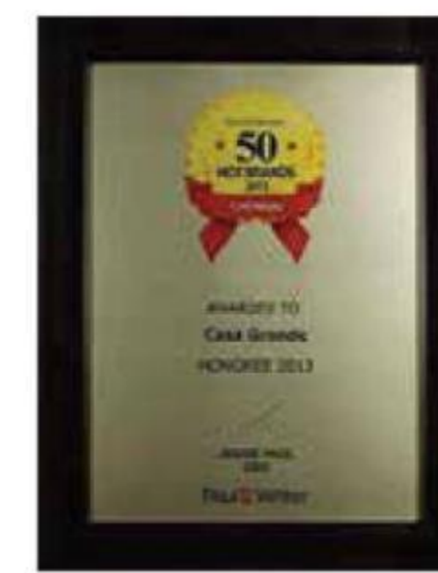
Top 50 Brands in Chennai - 2013 Paul Writer Magazine