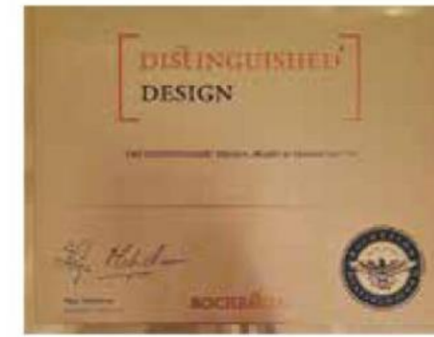
Distinguished Design Awards 2017 Casagrand ECR14