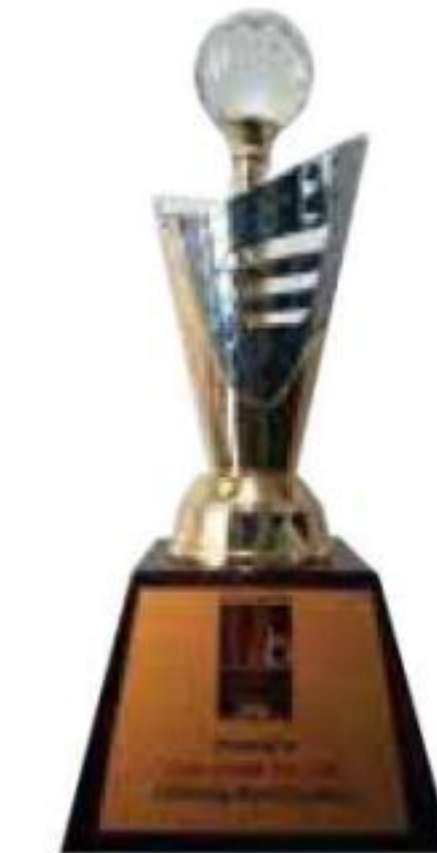
Best Realty Brand - 2015 Economic Times