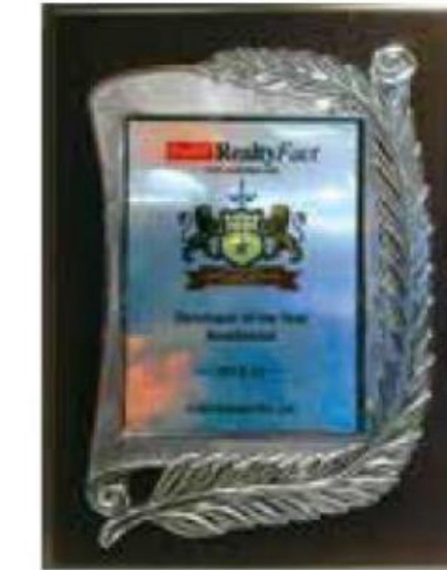
Developer of the Year Residential - 2015-16 Realty Fact