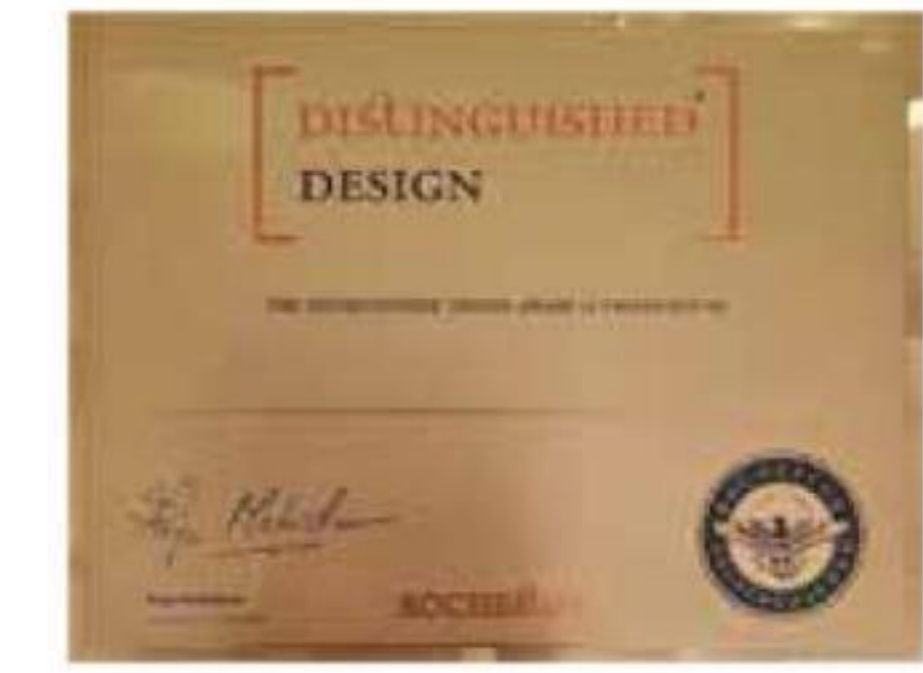
Distinguished Design Awards 2017 Casagrand Pallagio