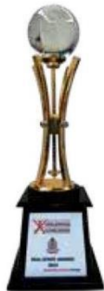
Most Admired Project in Southern Region - 2014 Casagrand Arena Worldwide Achievers