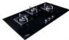
3 brass burners gas hob with 1 supernova triple frame burner