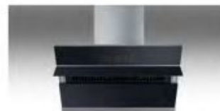
Chimney with wall mounted filter free hood and auto open smoke panel

The kitchen appliances mentioned here are a part of premium villas only and do not form a part of standard villas.