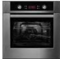
70 L built-in oven with 9+2 functions