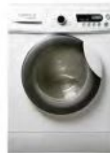
7 kg washing machine with 16 wash programs