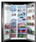
620 L refrigerator with 3 temperature zones