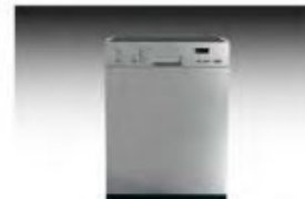
14 place settings semi-integrated dishwasher