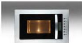
28 L built-in microwave oven with grill function

With Häfele's Range of Appliances; cooking, baking and washing are not mere chores – they provide an experience that is almost recreational! Häfele appliance brings about panache, sophistication and above all great functionality to your daily chores. It augments flexibility, co-ordination within the kitchen and it is completely compatible with the overall look and design of your kitchen cabinets.